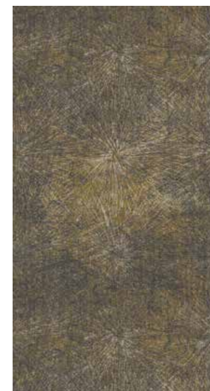
FIELD XE 01384852VL 78.9" W x 108" L