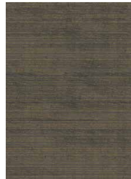
TEXTURE XA 01384856VL 78.9" W x 108" L