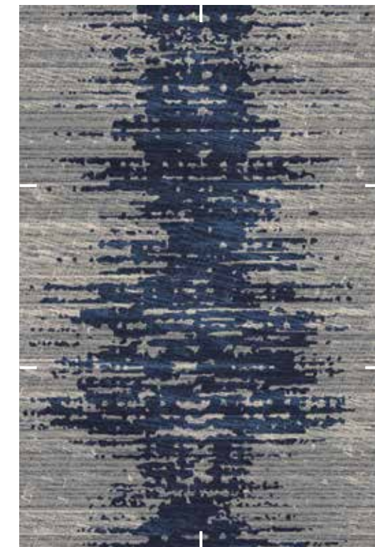
RUNNER B 01397230VL Grand Plaza Repeat: 2m x 3m