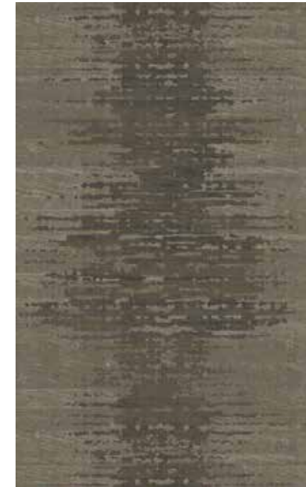
RUNNER XB 01384858VL 78.9" W x 108" L