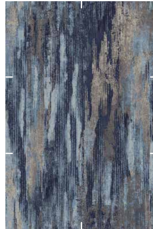
FIELD A 01396728VL Grand Plaza Repeat: 2m x 3m

The Eurythmic modular patterns can be integrated across the floor without visual disruption. Textured and adaptable, they complement a wide range of applications and styles, from resort chic to sleek urban sensibilities.