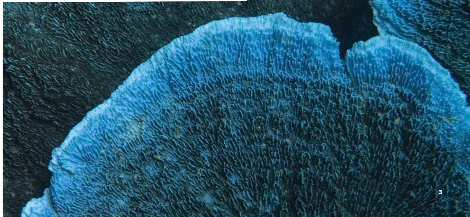
Field F 01393482VL, Terzo. 1m x 1m.

The Eurythmic Collection, inspired by the spirit of the fine arts and architecture, features versatile flooring that performs aesthetically and acoustically. Natural silhouettes, graceful lines, and harmonious themes combine to produce transformative visuals. Using the precision of decades-honed color technology, assemble stunning floorscapes and incorporate visual movement in any space.