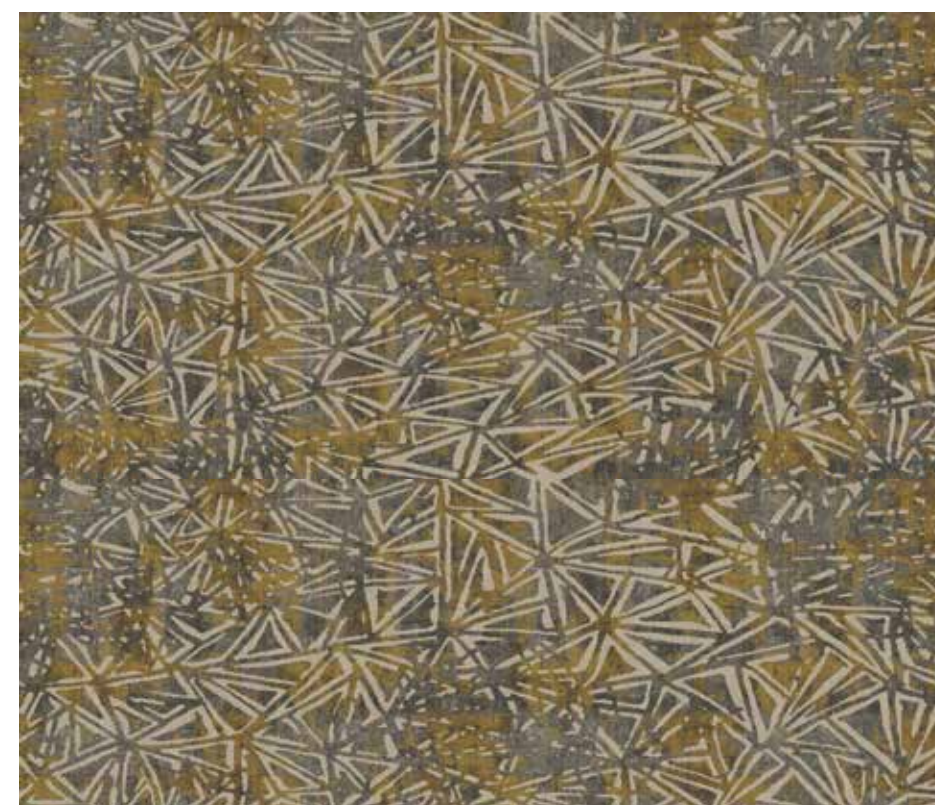
FIELD XD 01384855VL 157.7" W x 78.9" L