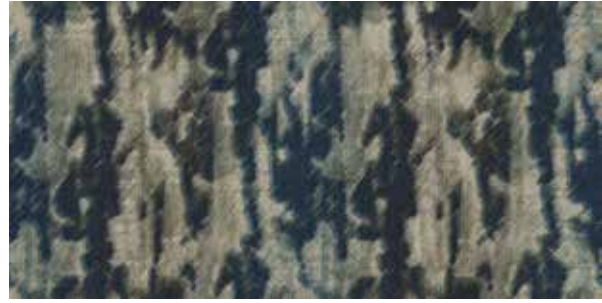
FIELD K 01399801VL Terzo Base Repeat: 2m x 1m