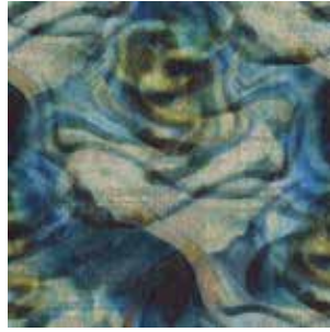
FIELD H 01394930VL Terzo Base Repeat: 1m x 1m