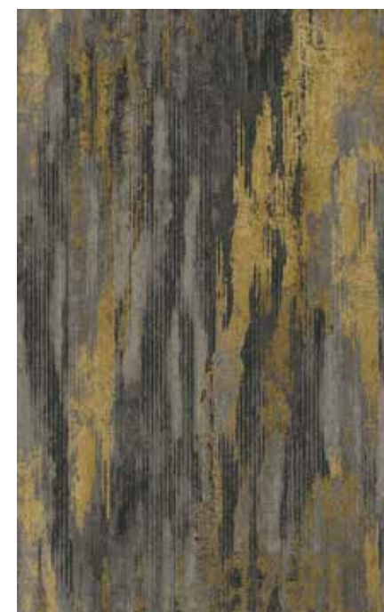
FIELD XA 01384854VL 78.9" W x 126.2" L

Premium yarn dyed and made in the USA, Eurythmic's Axminster patterns present woven texture in bold golds and grays. The IMO certified, woven design capabilities are made possible by high-speed equipment. Choose up to 16 colors per pattern.