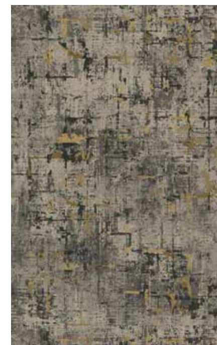
FIELD XB 01384859VL 78.9" W x 118" L