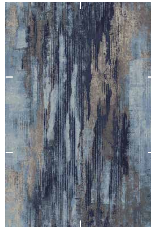
RUNNER A 01396004VL Grand Plaza Repeat: 2m x 3m