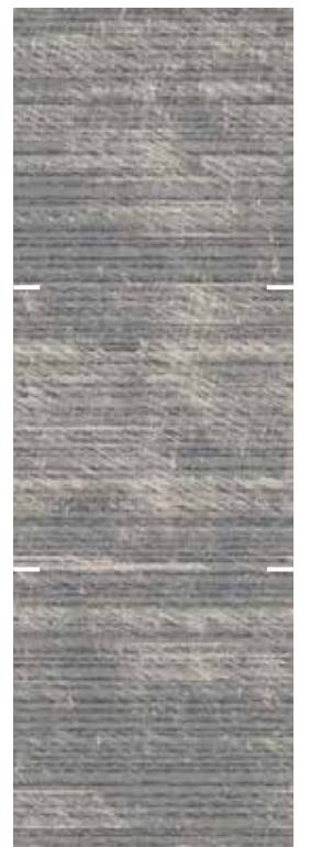
TEXTURE A 01397081VL Grand Plaza Repeat: 1m x 3m