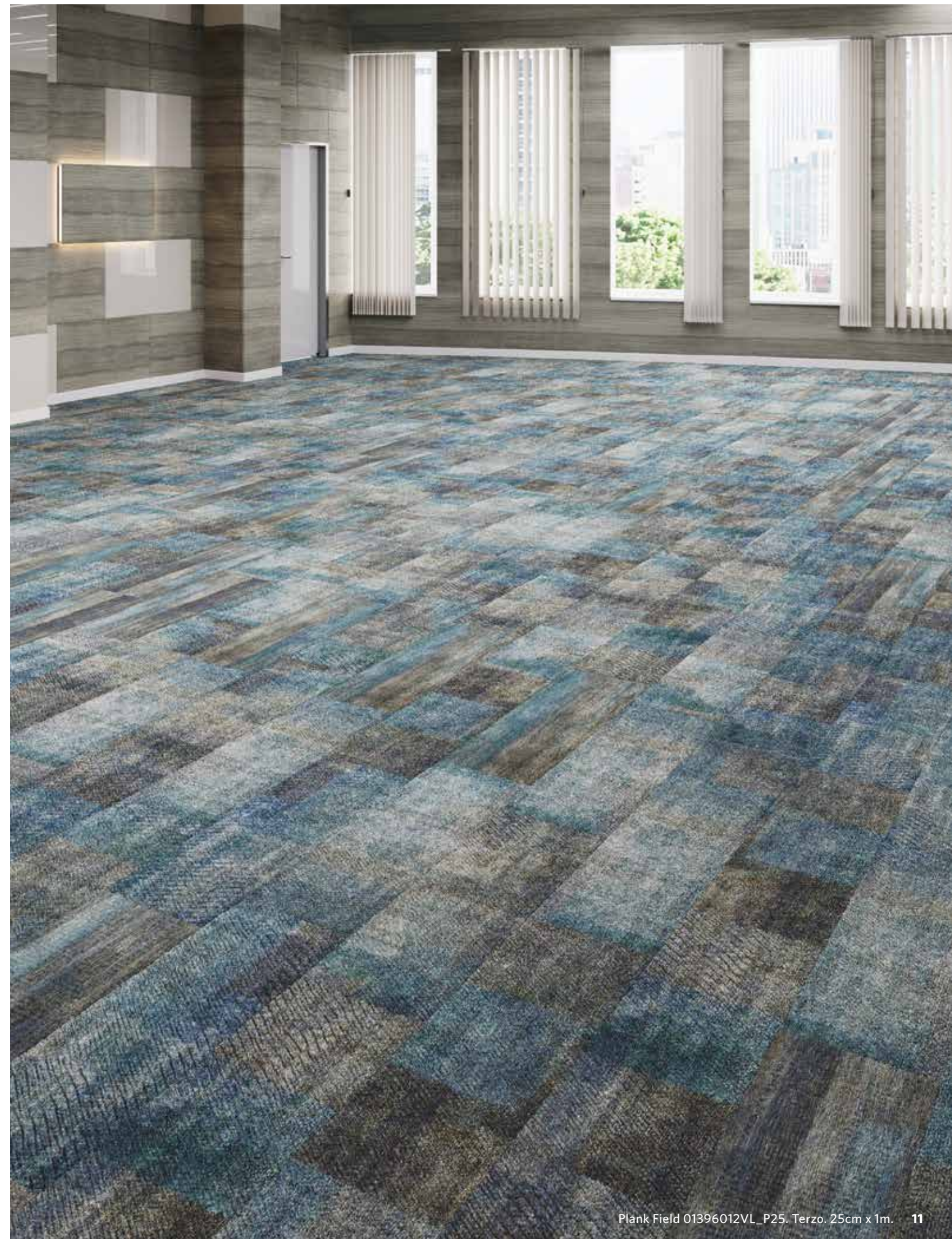
Plank Field 01396012VL_P25. Terzo. 25cm x 1m. 11