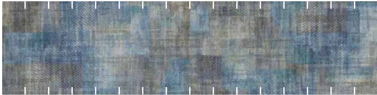
PLANK FIELD 01396012VL_P25 Terzo Base 25cm x 1m planks