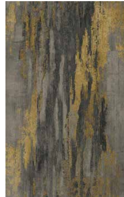
RUNNER XA 01384850VL 78.9" W x 126.2" L