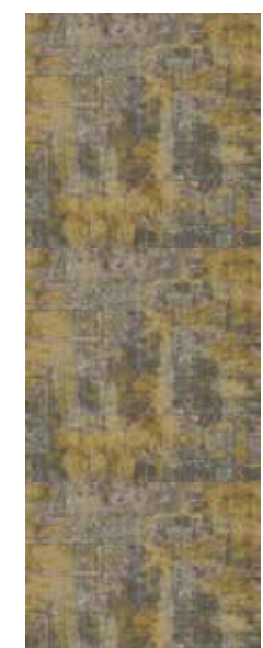
TEXTURE XC 01384860VL 39.4" W x 39.4" L