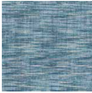
FIELD D 01393544VL Terzo Base Repeat: 1m x 1m