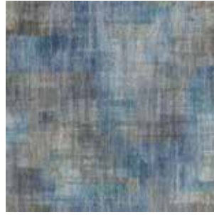
FIELD J 01396009VL Terzo Base Repeat: 1m x 1m