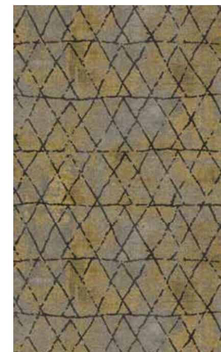
FIELD XC 01384857VL 78.9" W x 78.9" L