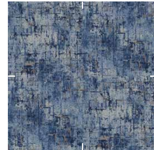
FIELD B 01395983VL Grand Plaza Repeat: 2m x 2m