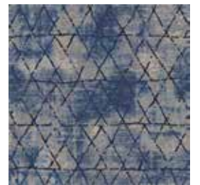
FIELD C 01397478VL Grand Plaza Repeat: 1m x 1m