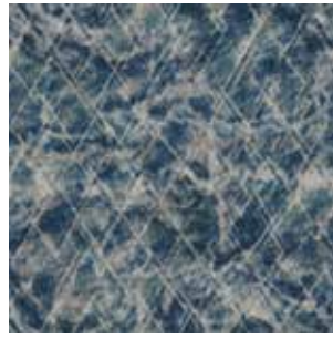
FIELD E 01394535VL Terzo Base Repeat: 1m x 1m