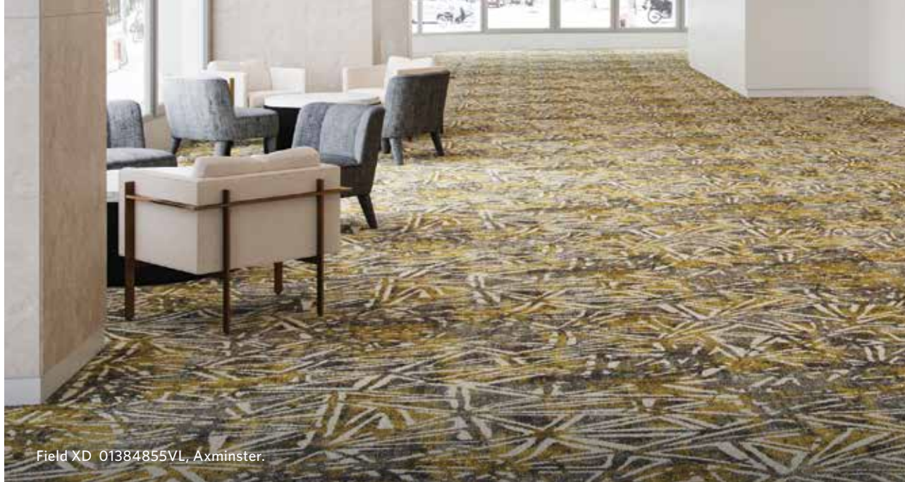
Field XD 01384855VL, Axminster.