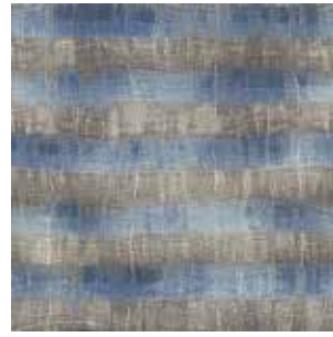
FIELD G 01393476VL Terzo Base Repeat: 1m x 1m