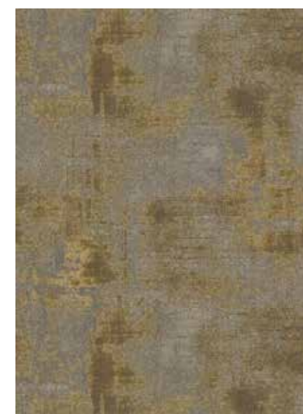
TEXTURE XB 01384861VL 78.9" W x 78.9" L