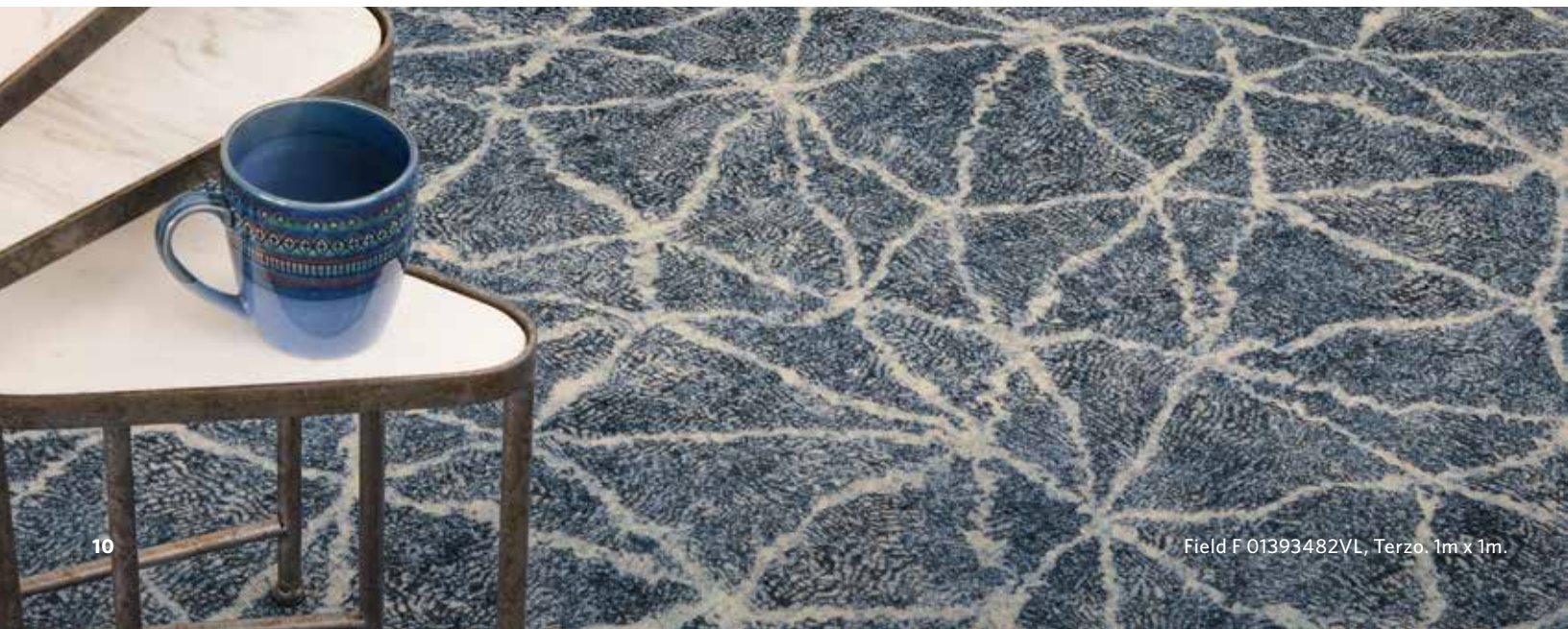
Field F 01393482VL, Terzo. 1m x 1m.